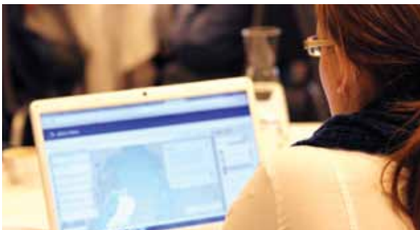
INSTITUTE OF THE NORTH

The workshop served as a useful platform from which technical experts within and between (maritime and aviation) sectors could communicate, share and add value to best practices—an opportunity that should be provided more regularly. At the same time, participants were clear in their call for more data collection and the addition of important layers in future iterations of the AMATII database and map.