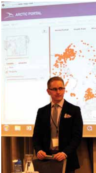
INSTITUTE OF THE NORTH

Much of the discussion focused on future increases and growth. However, it is important to recognize the urgent need to maintain and sustain the current infrastructure that supports Arctic communities in the face of climate change factors like permafrost degradation.