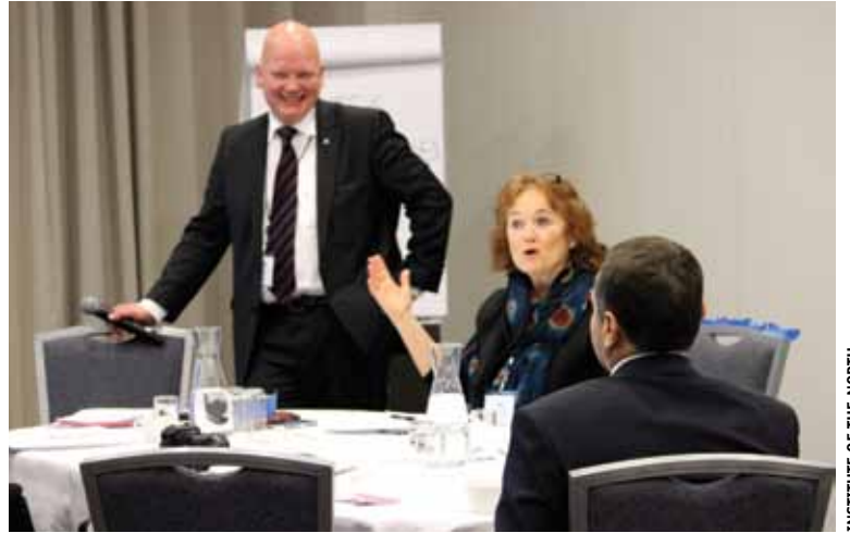
INSTITUTE OF THE NORTH