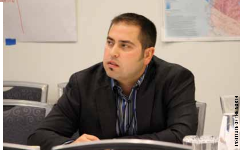
INSTITUTE OF THE NORTH