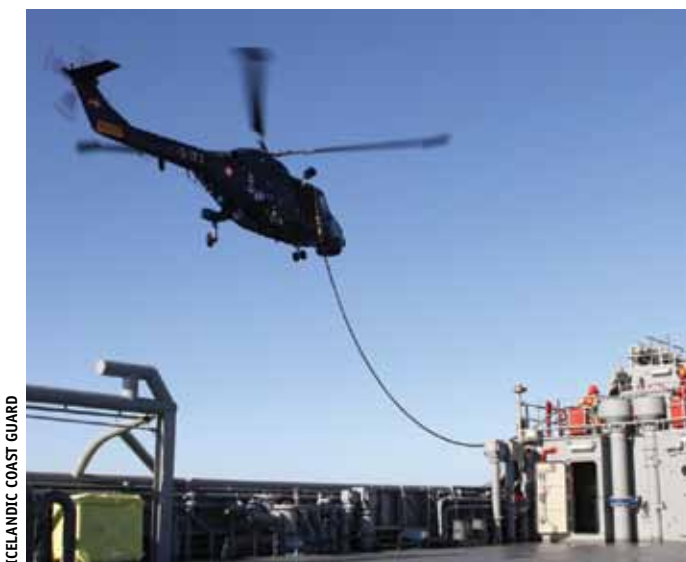
ICELANDIC COAST GUARD