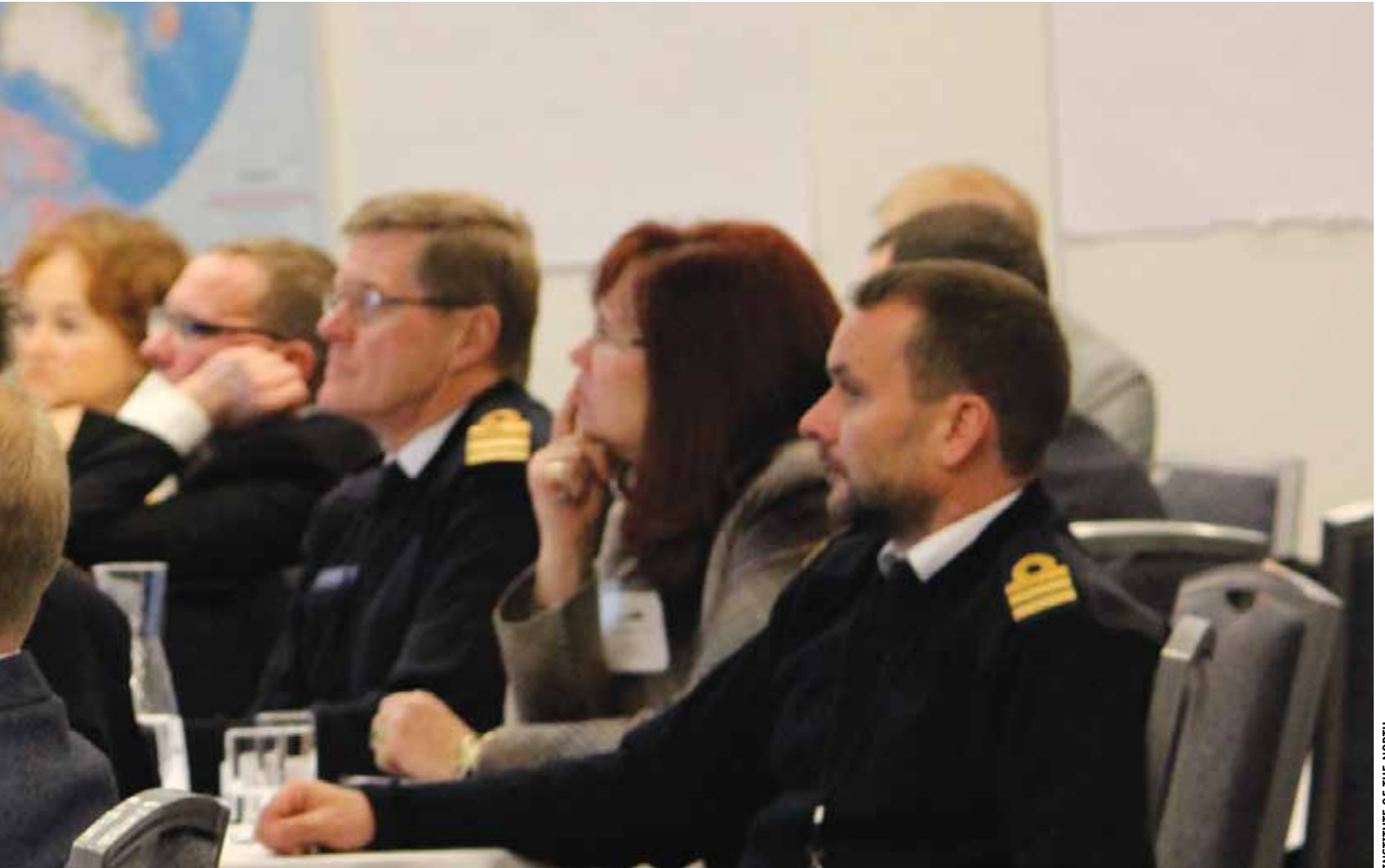
INSTITUTE OF THE NORTH