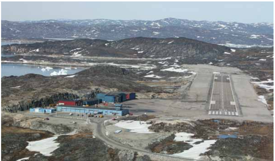
GREENLAND AIRPORT AUTHORITY