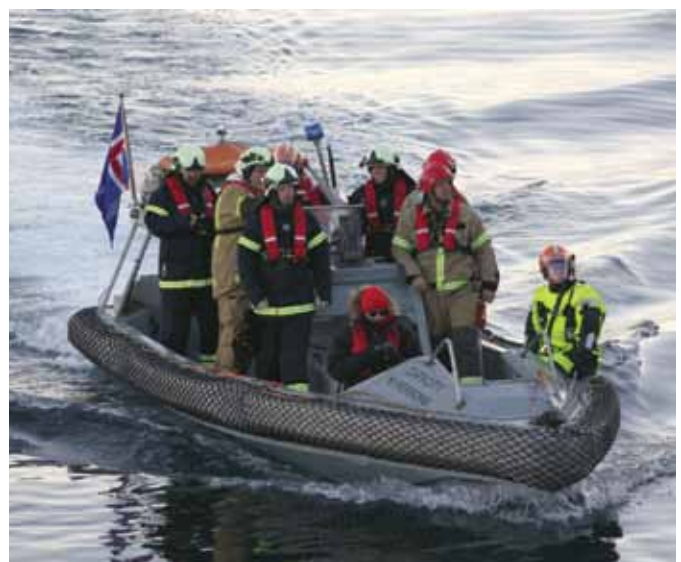
ICELANDIC COAST GUARD