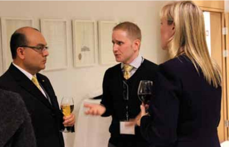
INSTITUTE OF THE NORTH